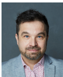
ERKKO LYYTINEN (YLE, FINLAND)