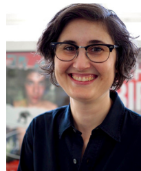
ASHLEY SMITH (SISYFOS FILM, SWEDEN)