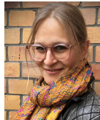
BETTINA KOLB (DW, GERMANY)